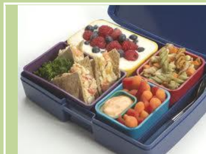
Waste Free Lunch Box