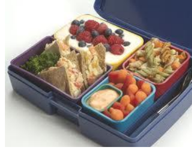
Waste Free Lunch Box

As a King County Green School , our school encourages waste reduction and recycling in the lunchroom and classrooms.